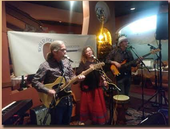
Gathering Time Folk-Rock Trio at the World Folk Music Association Showcase

We love supporting talented, emerging artists who lack the technical skills and funds for media services and products.