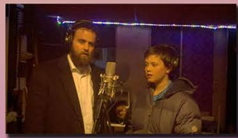
Father-son duo in the studio