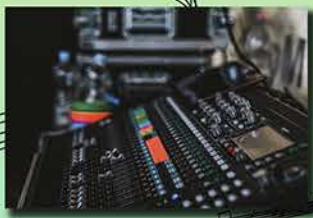
Photo and Video